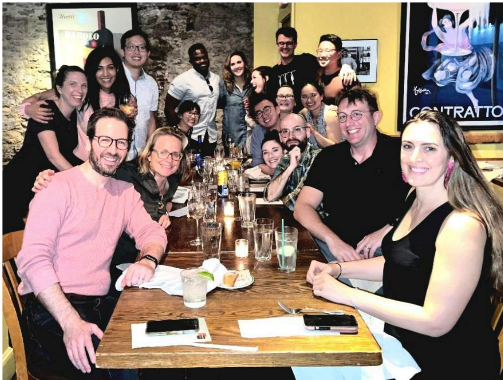
New Faculty Group End of Year Dinner 2023

This group recently held an end of year celebration at La Morra and had an excellent time!